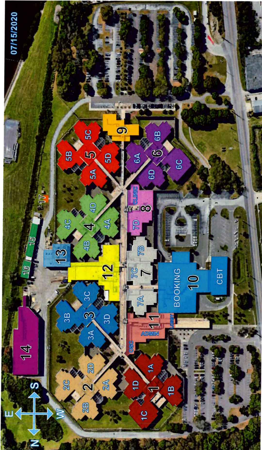
Jail Division I - Orient Road Jail (ORJ)